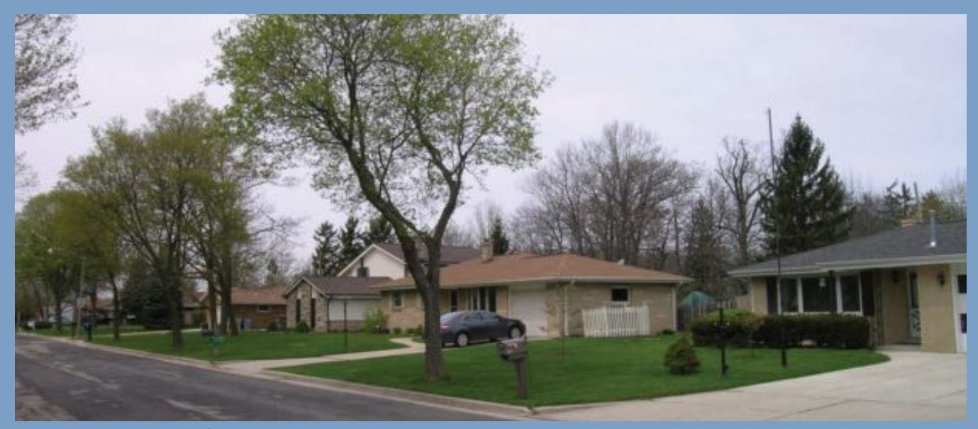
Todays neighborhood-6<sup>th</sup> & Abbot Ave.